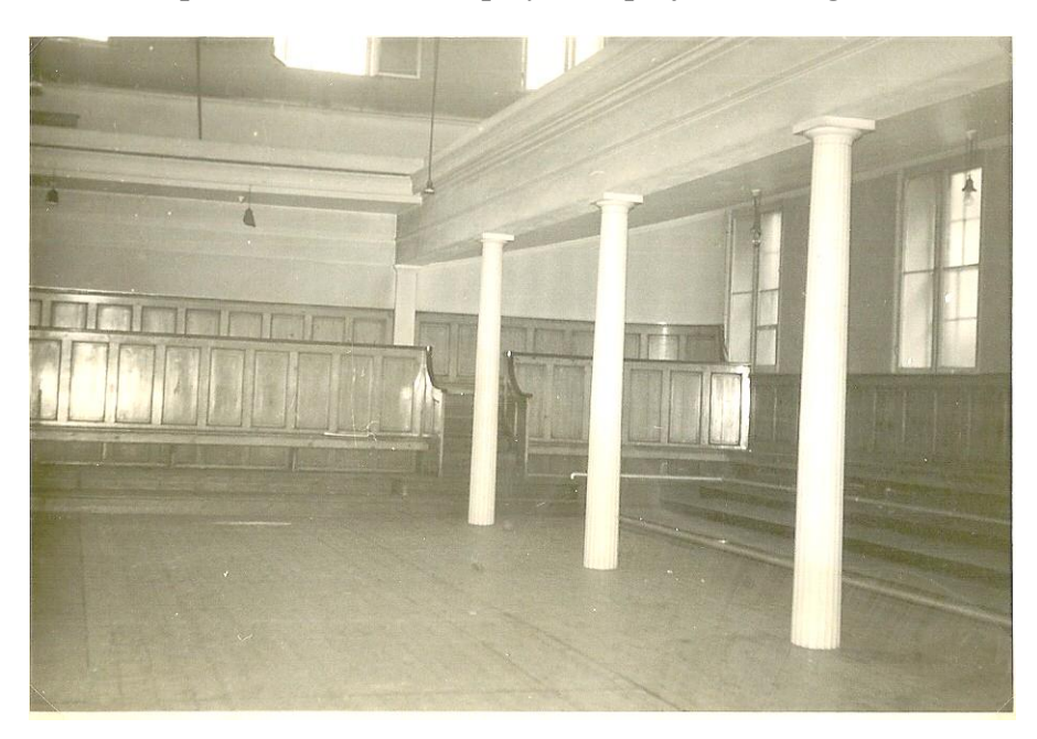
Figure 2. The main meeting room before alteration (Friends' Collection)

The building was altered in the 1860s, when Alfred Waterhouse, a member of the Manchester Friends, designed small-scale alteration, although it is not known exactly what was done. The work may have included the partial infilling of the original entrance to provide doorways, and the projecting addition to the basement on the south side for WCs. The first major phase of alterations took place in 1923 to designs by Hunter, Cruickshank & Seward. The women's meeting room was subdivided horizontally and vertically to create a central concourse, new staircase and a series of smaller rooms on both floors. A new small meeting room was provided on the north-east side of the ground floor. The work was undertaken to accommodate the Friends' Institute and the Friends' Byrom Street school. The original staircases and the vertically-sliding screen between the meeting rooms were removed, although the lifting mechanism for the latter was left in the roof space. Externally, some of the sash windows were widened and steel windows installed to provide more light. The basement was adapted and used for employment projects during the 1930s.