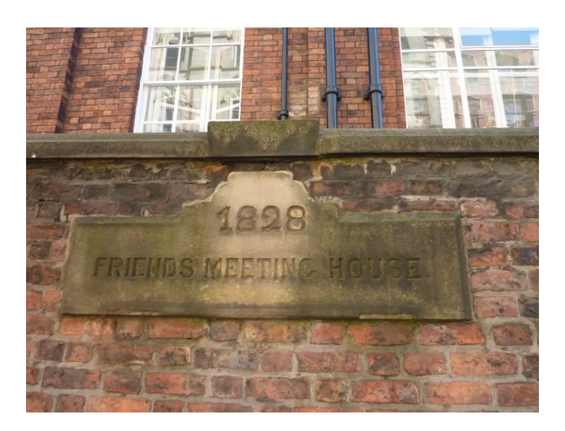
Figure 5. Stone panel in the precinct wall

The front boundary wall is ashlar surmounted by replacement steel railings to Mount Street; these walls return along the sides of the forecourt, with stone piers. From this point they continue around the site in brick laid in Flemish bond with stone copings. On the south side the wall incorporates a stone panel with the date 1828.