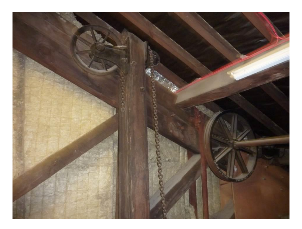
Figure 3. Part of the mechanism for raising the screen between the meeting rooms

larger meeting rooms to be divided by means of a partition which could be moved by raising vertically.